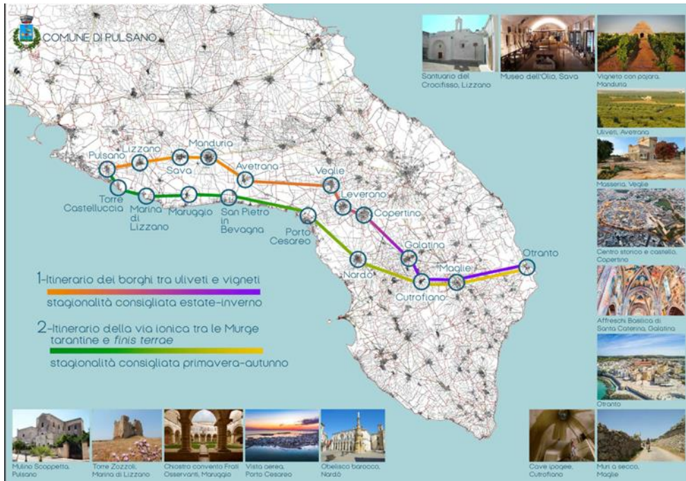
Fig.5: The stages of the two planned routes