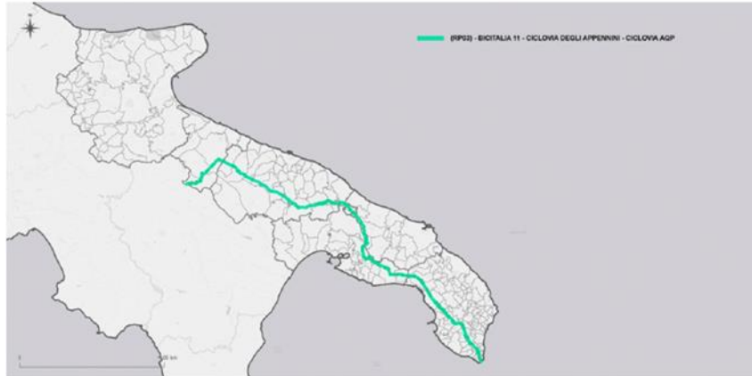
Fig.3: The Apennine cycle route

The Apennine Cycle Route intercepts the municipalities of Nardò, Veglie, Avetrana, Manduria, which are part of our two routes, and the RP06/BI14-Cycling of the Three Seas.