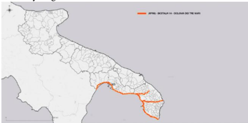
Fig.4: The Three Seas cycle route

The Apennine Cycle Route intercepts the municipalities of Nardò, Veglie, Avetrana, Manduria, which are part of our two routes, and the RP06/BI14-Cycling of the Three Seas.